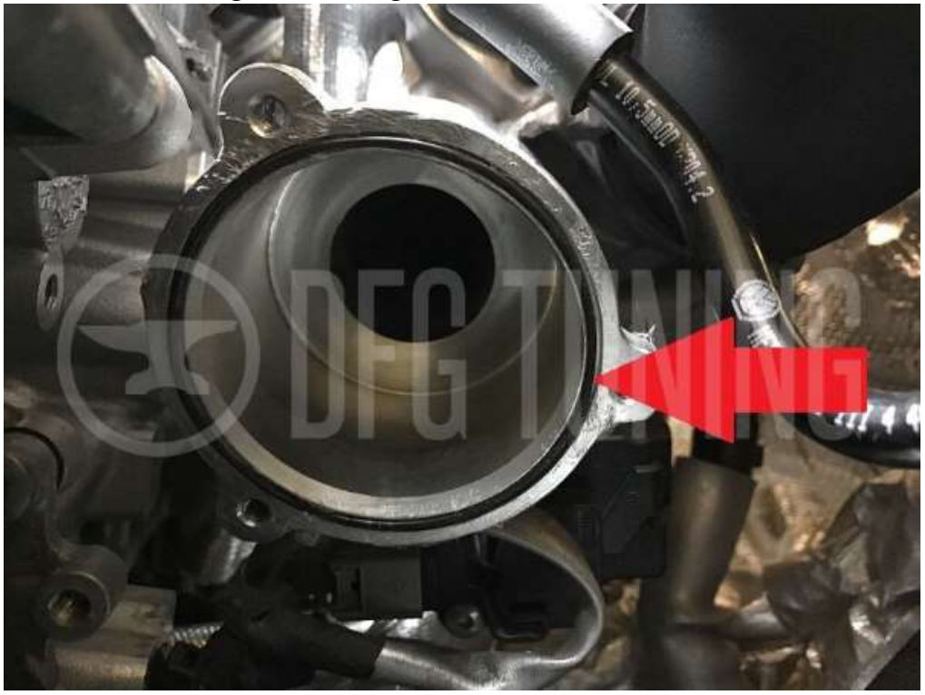
10. Install the DFG Turbo Muffler delete by holding it in place against the turbo housing while re-installing the (3) 5mm Allen bolts.

9. Place stock O-ring back in this groove.