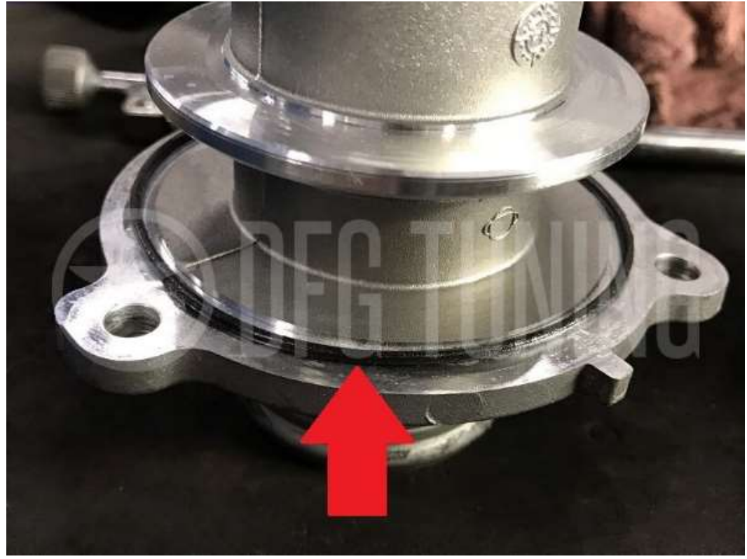
8. Apply a liberal amount of silicone grease to the groove that is shown below:

7. Carefully remove the stock O-ring from the turbo muffler.